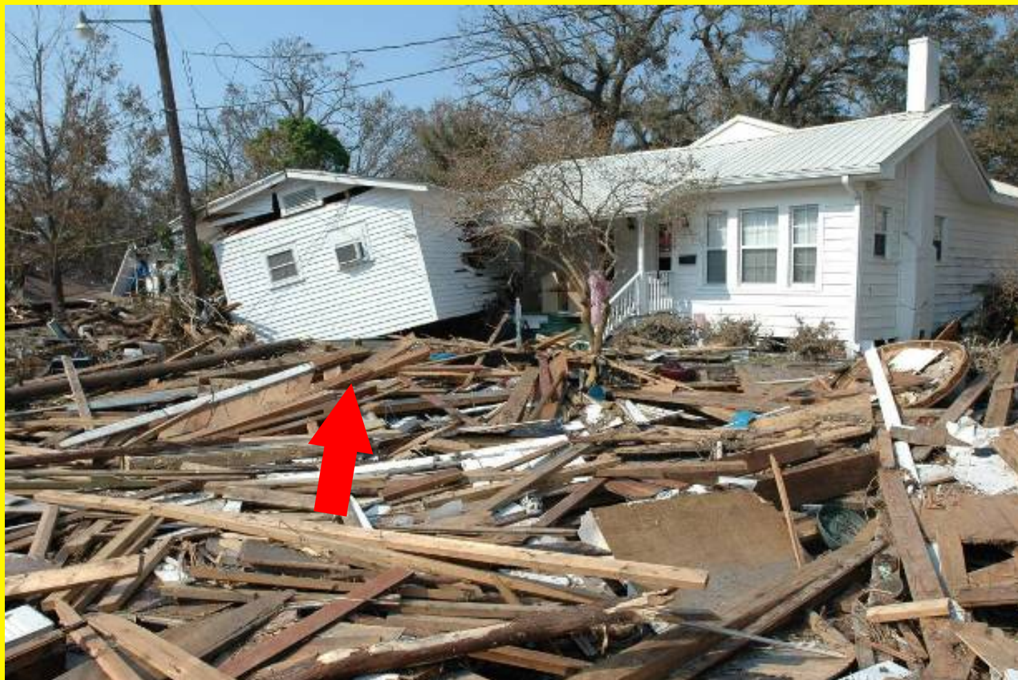
▶ “Dorothy” houses